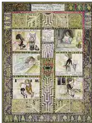
Before I Loved You Love, Nothing Was My Own (2015): £9,500 excl. VAT