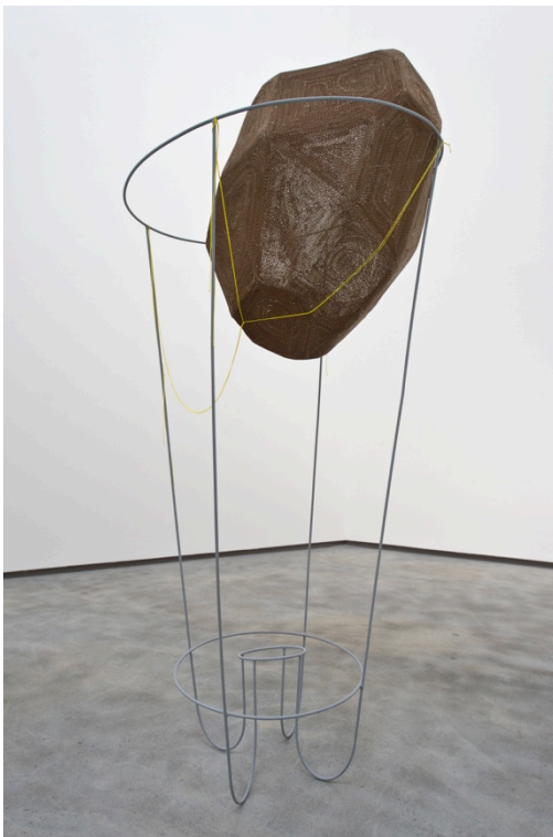
LITTER BIN MILD STEEL, MASONS LINE, CARD, PRIMER, 127 X 250 X 105 CM - 2012