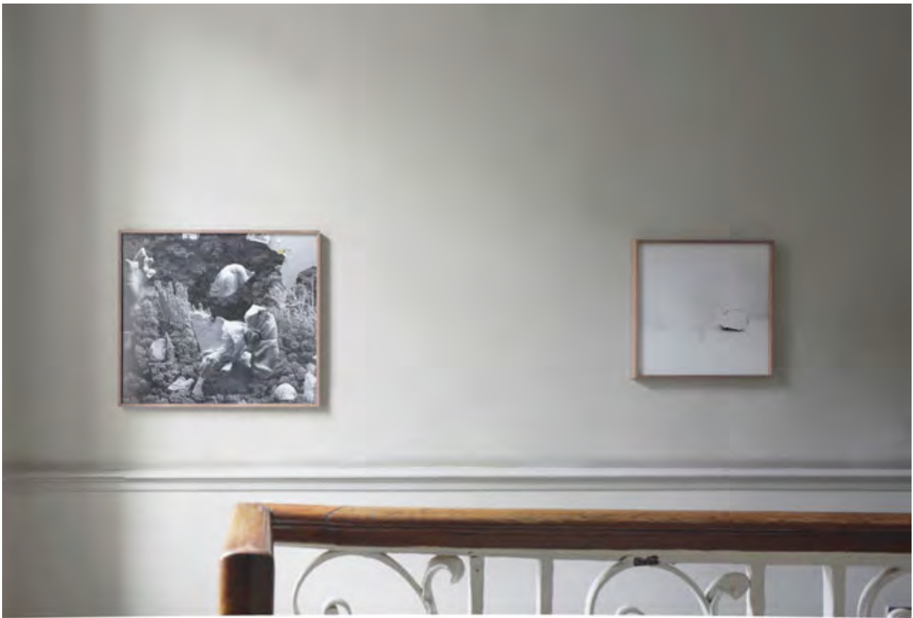
Ailbhe Ní Bhriain: Reports to an Academy, installation view.