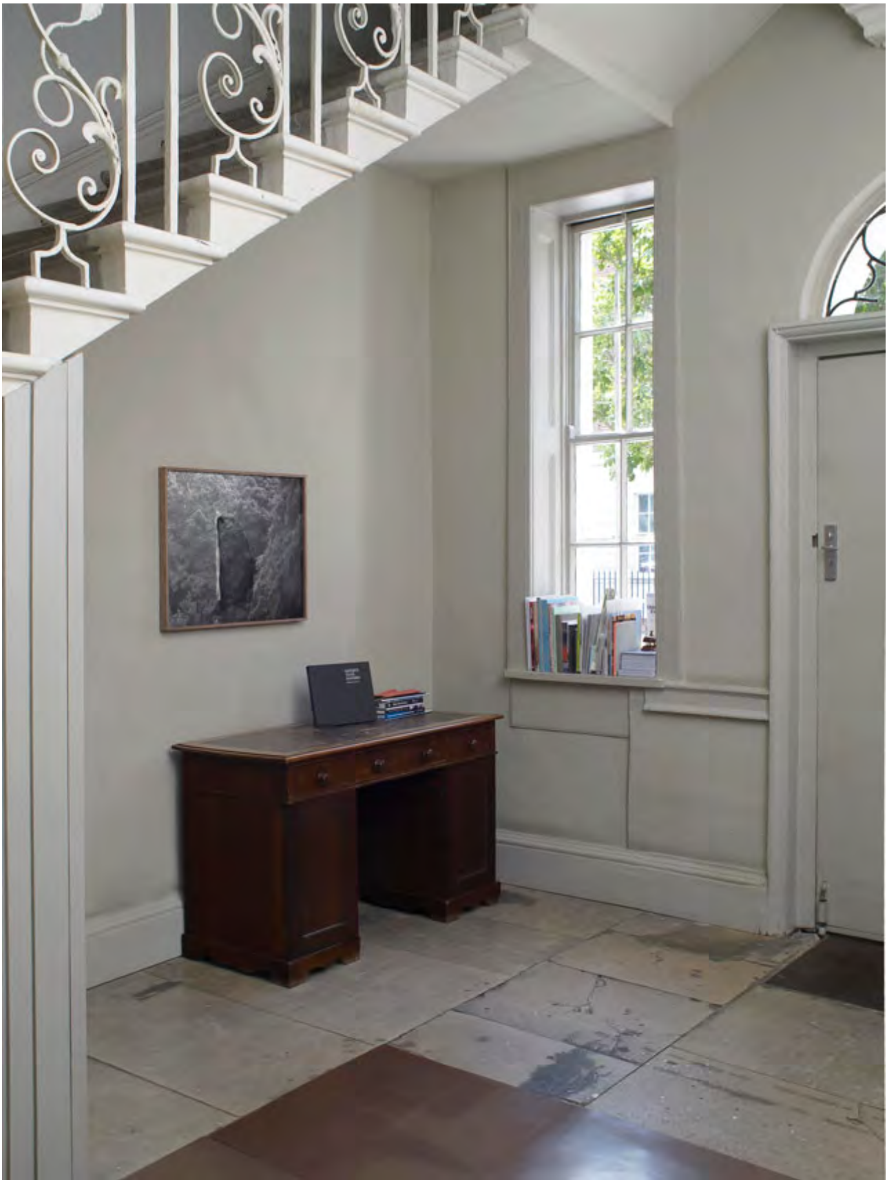
Ailbhe Ní Bhriain: Reports to an Academy, installation view.