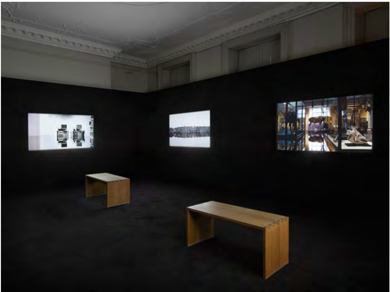
Ailbhe Ní Bhriain: Reports to an Academy, installation view.