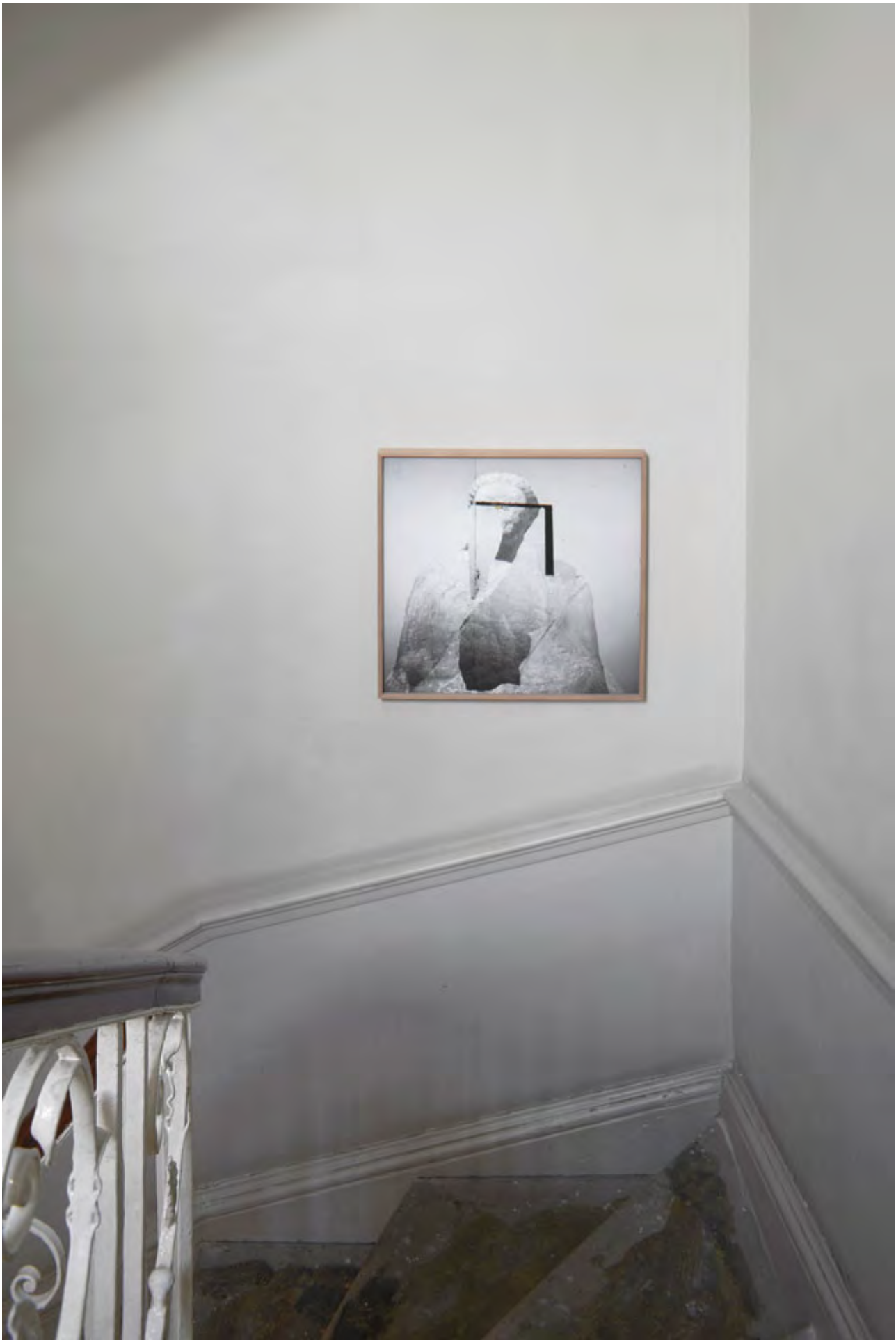
Ailbhe Ní Bhriain: Reports to an Academy, installation view. Courtesy Ailbhe Ní Bhriain and Domo Baal. Photograph: Andy Keate.