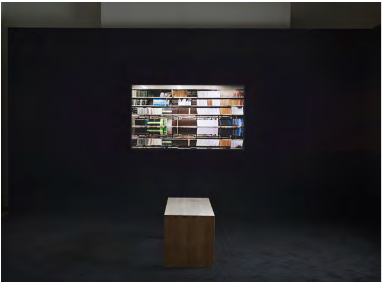
Ailbhe Ní Bhriain: Reports to an Academy, installation view.