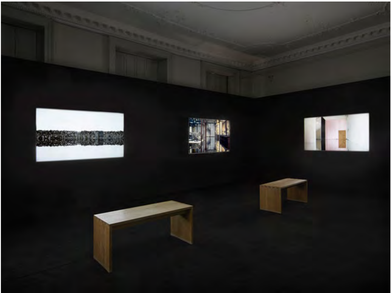
Ailbhe Ní Bhriain: Reports to an Academy, installation view.