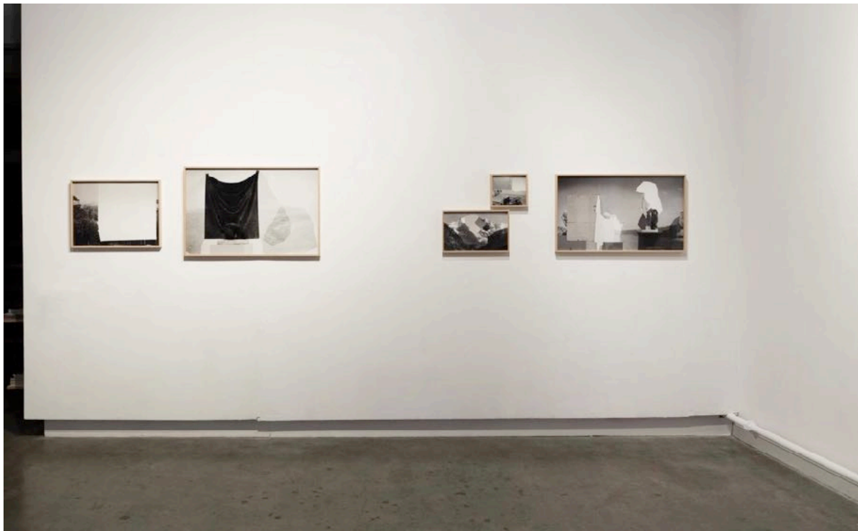
INSTALLATION VIEW OF AILBHE NÍ BHRIAIN'S 'THE PASSENGER' FROM 'NEW IRISH WORKS' AT THE LIBRARY PROJECT, DUBLIN, 2017

THE WORK TAKES ITS TITLE FROM THE NABOKOV SHORT STORY 'THE PASSENGER'. IN THE STORY A SEEMINGLY DRAMATIC PLOT IS BUILT AND IS THEN EXPOSED AS A SERIES OF DISCONNECTED DETAILS, CONFLATED BRIEFLY IN THE IMAGINATION. IN THESE PRINTS THE DEVICE OF BOTH PRESENTING AND TAKING APART THE PROPS OF NARRATIVE IS USED TO TEST HOW WE READ AN IMAGE, LEAVING THE VIEWER TO, IN NABOKOV'S PHRASE, 'NOTICE AND FONDLE DETAILS'.