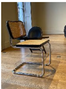
Scenario (potlatch) (pair of wooden chairs with many thanks to Marcel Breuer, Pier Giacomo and Achille Castiglioni)