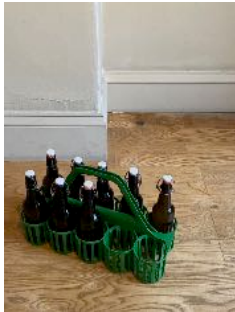
Scenario (lost) (eight bottles, flip top lids, home made pear ale) £17.99 each

With a handful of windfall, pocketed from the weeping pear tree. Their weight in my pockets prompted the translation as a toast to Barbara.