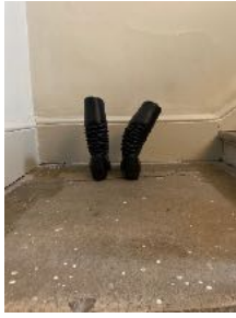
Scenario (progress) (Turkish goatskin farmers boots)