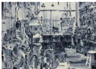
WORKBENCH 2 OIL ON CANVAS, 50 X 70CM STRETCHED OVER WOOD SUB FRAME 2023