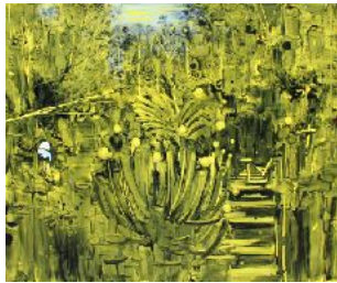
A LOVE OF MANY THINGS 4