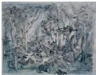
3 HOURS 8 MINUTES

OIL ON BOARD, 14 X 16.5CM WOOD FRAME, GLASS: 27.3 X 29 X 3.5CM 2023