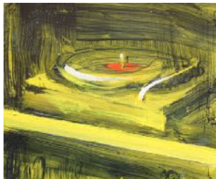
TROUT MASK REPLICA

OIL ON BOARD, 14 X 16.5CM WOOD FRAME, GLASS: 27.3 X 29 X 3.5CM 2023