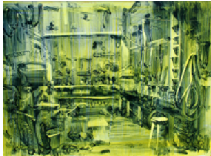
LIGHT FICTION 5

OIL ON BOARD 30 X 40CM WOOD FRAME, GLASS: 45 X 54 X 3.5CM 2023