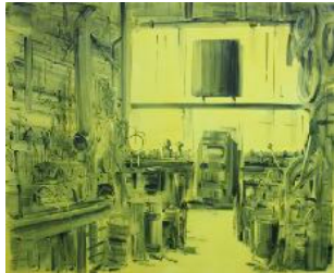
LIGHT FICTION 2 OIL ON CANVAS 110 X 132CM STRETCHED OVER WOOD SUB FRAME 2024