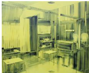
ROOM 601 - 8 OIL ON CANVAS, 110 X 132CM STRETCHED OVER WOOD SUB FRAME 2024