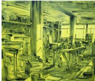
WORKSHOP: HASTINGS OIL ON CANVAS, 121 X 142CM STRETCHED OVER WOOD SUB FRAME 2021