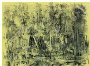
ALLOTMENTS OIL ON BOARD, 29 X 39CM WOOD FRAME, GLASS: 45 X 53.5 X 3.5CM 2023