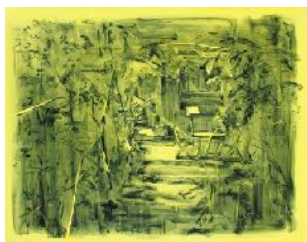
BIRD TABLE OIL ON CANVAS, 50 X 70CM STRETCHED OVER WOOD SUB FRAME 2024