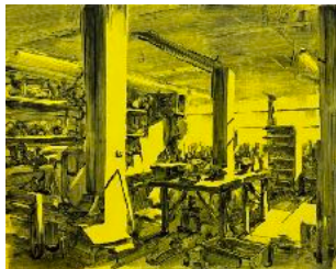
WORKSHOP: HASTINGS 8

OIL ON BOARD 30 X 40CM WOOD FRAME, GLASS: 45.2 X 53.8 X 3.5CM 2023