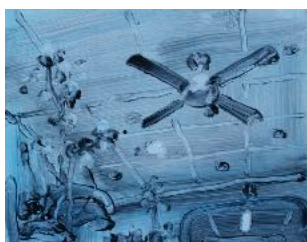
FOUR O' CLOCK

OIL ON BOARD, 18 X 23CM WOOD FRAME, GLASS: 29.8 X 24.8 X 3.5CM 2024