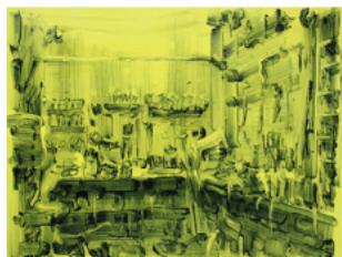
LIGHT FICTION 3 OIL ON BOARD, 38.5 X 50CM WOOD FRAME, GLASS: 45 X 53.5 X 3.5CM 2024