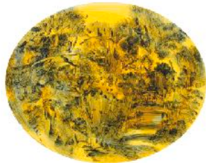
2 HOURS 43 MINUTES