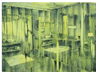
ROOM 601 (THE SMOKE DETECTOR) OIL ON CANVAS, 90 X 120CM STRETCHED OVER WOOD SUB FRAME 2024