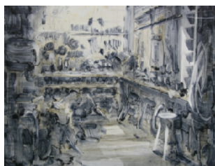
LIGHT FICTION 4 OIL ON BOARD, 30 X 40CM WOOD FRAME, GLASS: 45 X 53.7 X 3.5CM 2023