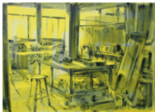
WORKSHOP: HASTINGS 9 OIL ON CANVAS, 50 X 70CM STRETCHED OVER WOOD SUB FRAME 2024