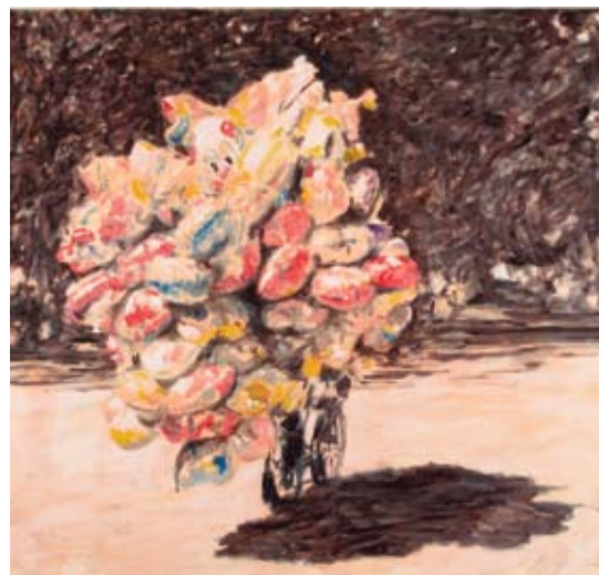
Robert Holyhead Untitled (shaped) , 2006, oil on canvas, 46 x 30.5 cm. Private collection, London. Bruno Pacheco Untitled (Balloons Man) , 2007, acrylic on paper, 160 x 128 cm. Opposite: Lara Viana Forma , 2008, oil on board, 46.5 x 40 cm.