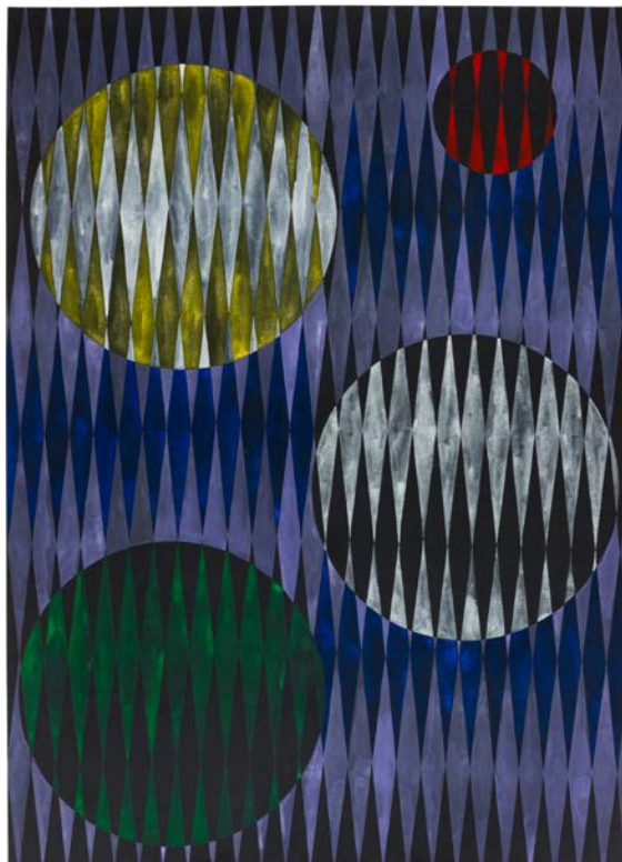
Untitled pencil, colour pencil and watercolour on paper 105×75cm 2022 frame: 113.5 x 83.5cm stained walnut, floated on a museum spacer on black backing, sub-frame, fillets, AR70 glass