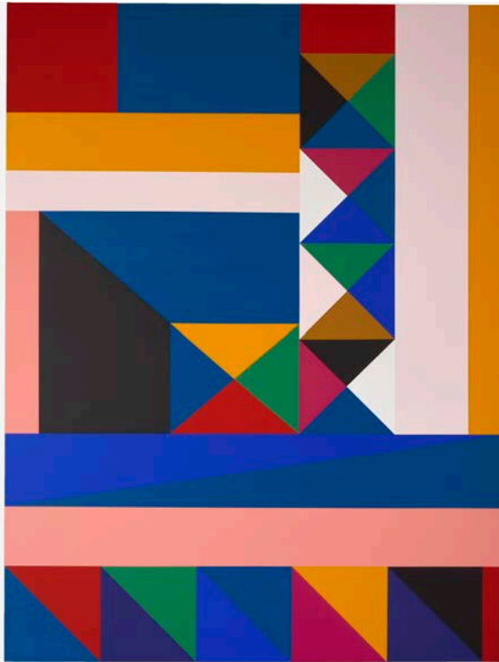
Autumn acrylic on canvas stretched over a wood subframe 180 × 135cm 2023