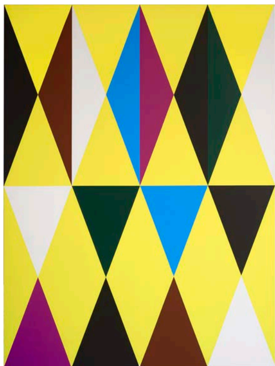
Summer acrylic on canvas stretched over a wood subframe 180 × 135cm 2022