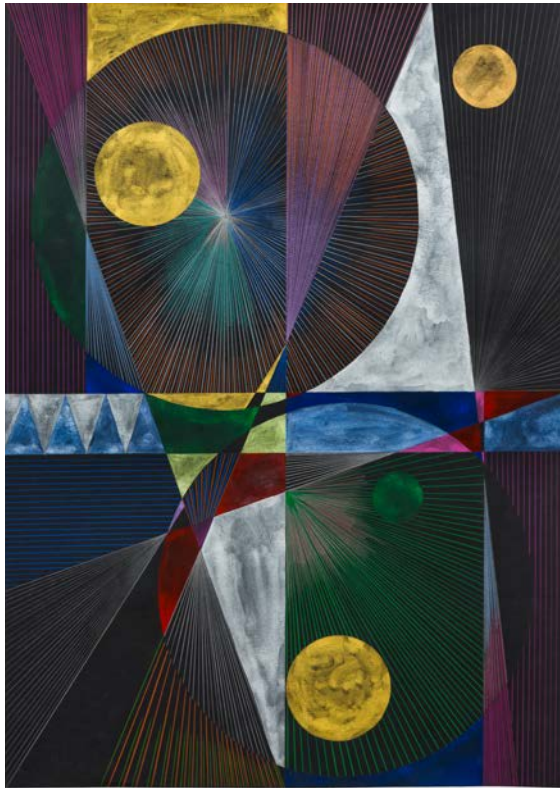
Untitled pencil, colour pencil and watercolour on paper 105×75cm 2022 frame: 113.5 x 83.5cm stained walnut, floated on a museum spacer on black backing, sub-frame, fillets, AR70 glass