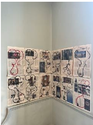
LIFE & ARTS WATERCOLOUR ON TWELVE ON FINANCIAL TIMES PAGES EACH 58 X 35CM 2020