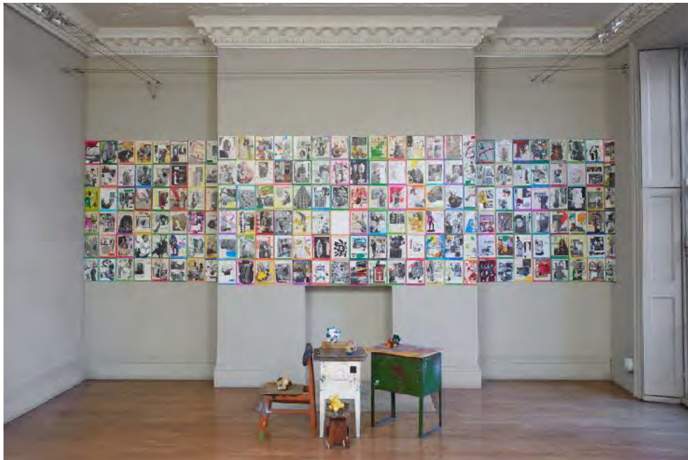
The Least We Could Do Is Wave To Each Other installation of works on paper collage, paint, pencil on paper, unframed all approx. 25 x 19cm 2018