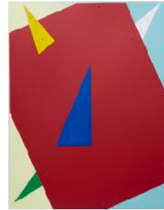
Full Fingered Head Massage paint on steel 101x76cm 2022