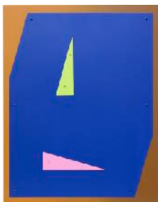
Andy Kaufman's Elvis paint on steel 69x54cm 2022