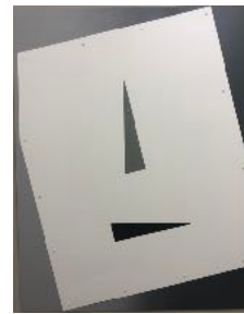
Vintage Head Shot paint on steel 100x78cm 2022