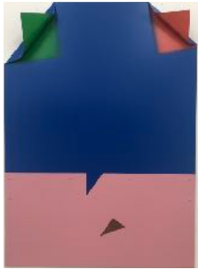
Adam West paint on steel 97x70x5cm 2022

entrance/ground floor/first floor/landing