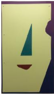
Pinkie paint on steel 90x52cm 2022