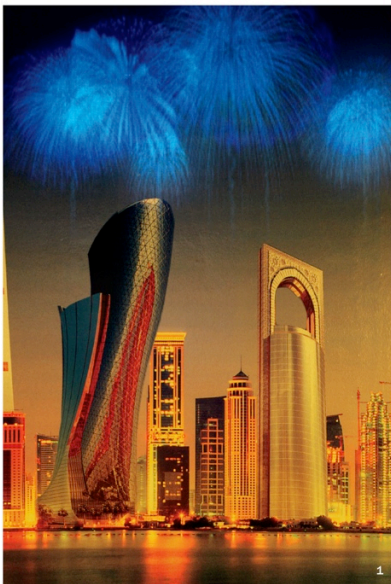
1. GCC, Achievements In Figures, Figure A: Amalgamated City (detail) , 2013, digital video, wallpaper, 13' 1 1/2" x 98' 5 1/4". From "Speculations on Anonymous Materials."

NICOLAUS SCHAFFHAUSEN IS DIRECTOR OF THE KUNSTHALLE WIEN, VIENNA, AND STRATEGIC DIRECTOR OF FOGO ISLAND ARTS, AN INITIATIVE OF CANADA'S SHOREFAST FOUNDATION. HE CURATED THE GERMAN PAVILION FOR THE 52ND AND 53RD VENICE BIENNALES; UPCOMING PROJECTS IN VIENNA INCLUDE AN EXHIBITION OF THE WORK OF TONY CONRAD AND A THEMATIC GROUP SHOW, "POLITICAL POPULISM."