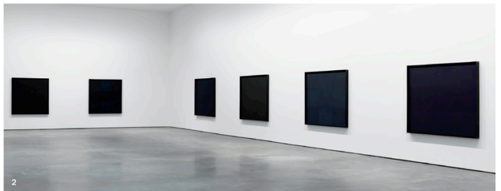
2. View of "Ad Reinhardt," 2013, David Zwirner, New York. 5. Camille Henrot, Mont Analog, Roman d'aventures alpines 'Pour revenir aux sources, on devait aller en sens inverse' (Mount Analogue, Alpine Adventure Novel 'To return to the source, one should go in the opposite direction') , 2012, flowers, vase, plaster, floral foam, dimensions variable.

AD REINHARDT (DAVID ZWIRNER, NEW YORK; CURATED BY ROBERT STORR) With comics, drawings, and collages in one room, black paintings in another, and a slide projection of 360 photographs in a third, Storr's distinctive miniretrospective shed light on the links between Reinhardt's pop-cultural interests and his pursuit of abstraction's logical conclusion, while bearing witness to the artist's satiric, critical, and brilliant mind.